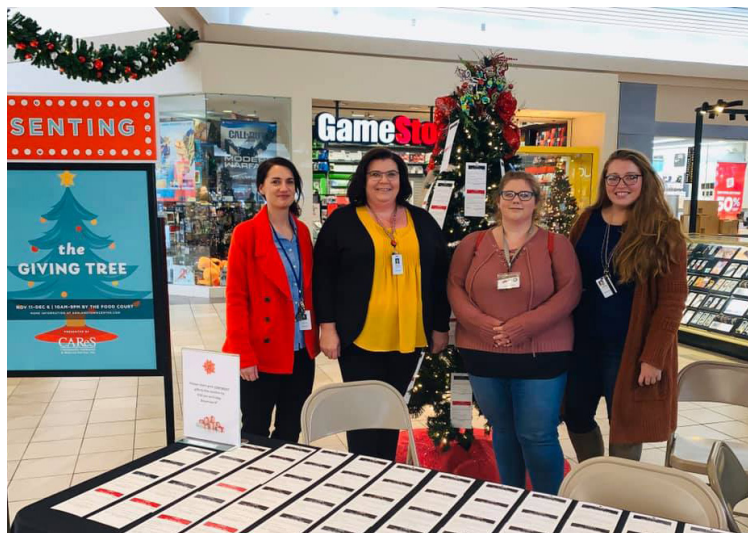
Safe Harbor Staff volunteers for the CAREs Giving Tree at the Ashland Mall to help support the children in our community.